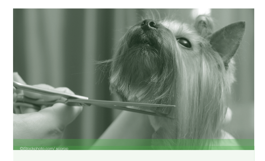
I've finally found magic—I've discovered I work well with animals

One day I accidentally got my hand burned from splattering hot oil and had to rush to a medical clinic at the school for treatment. I only lasted for a short time at that job because I made one mistake: tired after a long shift one