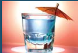
50ml (1.5oz) cocktail