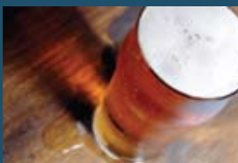
350ml (12oz) beer