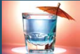
50ml (1.5oz) cocktail