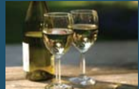
150ml (5oz) wine