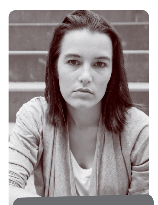
Feeling low or sad most of time may be a sign that you need extra support.

You might be navigating a lot of big changes: graduating high school, pursuing postsecondary education, leaving home, starting a career, and more. Some of these changes are exciting, and some may be a bit scary or overwhelming. Any change can be stressful, and stress can have a big impact on your mood. It's normal to feel sad or low from time to time, but feeling low or sad most of time may be a sign that you need extra support.