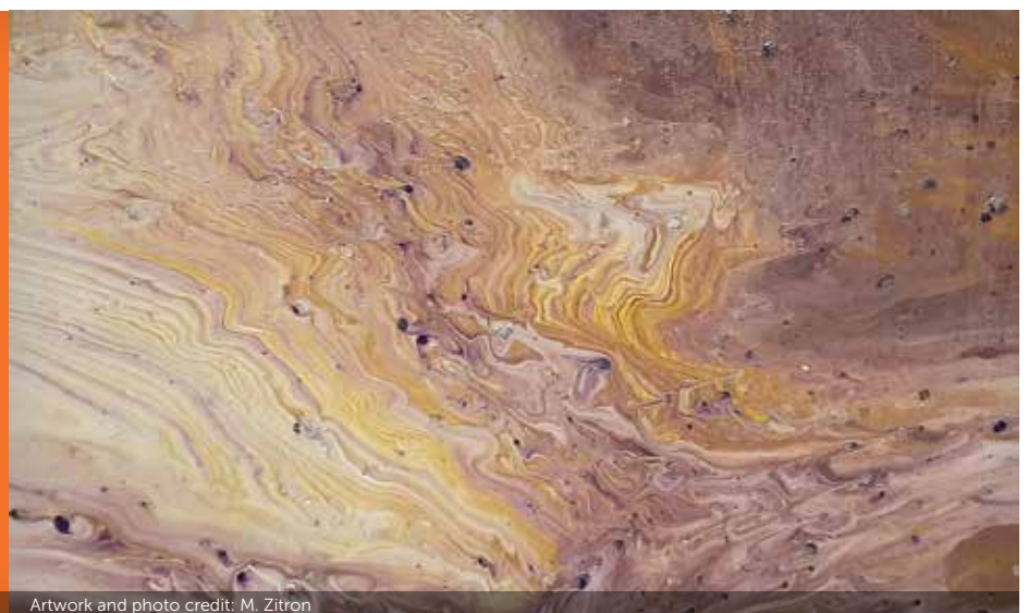
Artwork and photo credit: M. Zitron